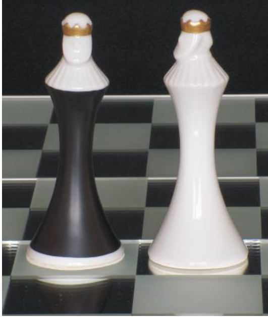
King 10,5cm (4.1")