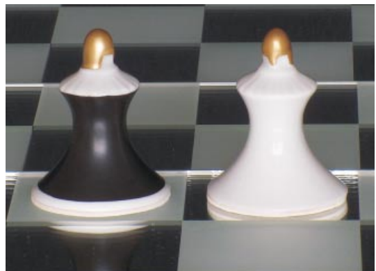
Pawn 5,0cm (2.0")