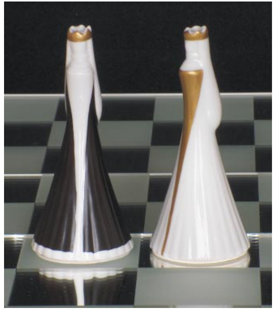
Queen 9,5cm (3.7")