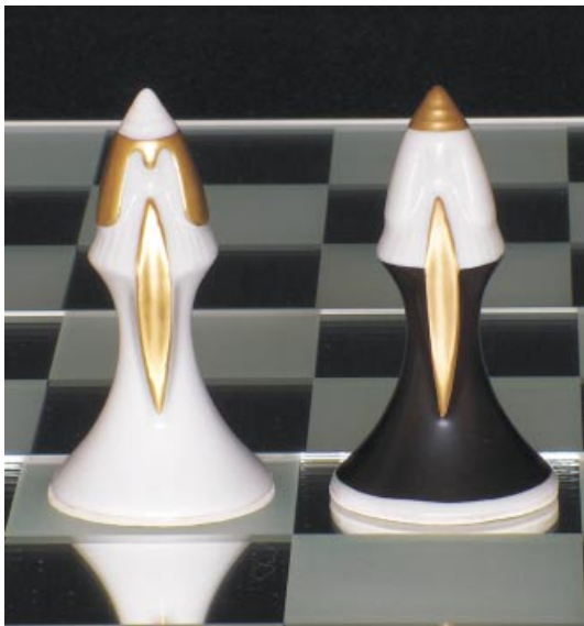
Bishop 7,5cm (3.0")