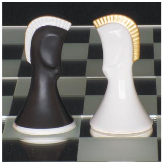
Knight 7,5cm (3.0")