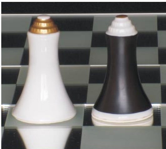
Rook 6,5cm (2.6")